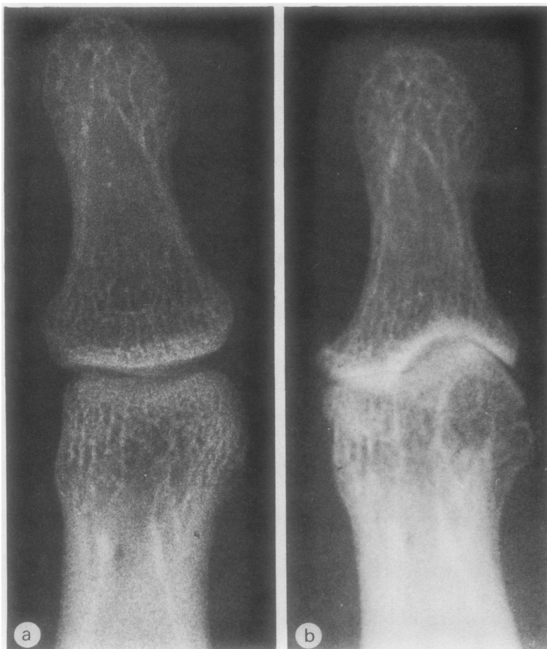
Figure 1: Radiographs of the distal interphalangeal joint of the left middle finger of a female transplant recipient (17 years' duration; no haemodialysis) at age 29 (a) and 37 (b), showing progressive loss of articular cartilage, erosion of subchondral bone, and osteophytosis. Similar radiological changes in different stages of evolution were present in other distal interphalangeal joints. Several fingers in both hands were affected by Heberden's nodes, and a cystic node had occurred without inflammation over the distal interphalangeal joint of the left little finger at age 36. All distal interphalangeal joints were stiff and restricted.

Ninety four (55 male, 39 female) of a possible 118 patients receiving chronic haemodialysis were surveyed between May 1986 and January 1987; this group has been described elsewhere. 2 Of a possible 188 renal transplant recipients, 116 (74 male, 42 female) seen consecutively at the renal outpatient clinic between April and June 1988 were also studied. Patients who received renal allografts between the time of the survey of dialysis and transplant recipients were included only in the group receiving chronic haemodialysis. Five transplant recipients declined to participate. All patients underwent anteroposterior radiographs of hands and were questioned about the presence of pain and stiffness in the fingers. Radiographs were screened by RS for the presence of OA. Abnormal radiographs were reviewed in a blinded fashion by IJSD and NPH and graded 0 to IV for OA according to the method of Lawrence and Kellgren 10 ; those patients with radiological grade III or IV OA in at least one joint were selected for further study. Grade III OA comprises moderate joint space narrowing and definite osteophytes, whereas grade IV OA comprises complete loss of joint space with florid osteophytes and subchondral sclerosis.