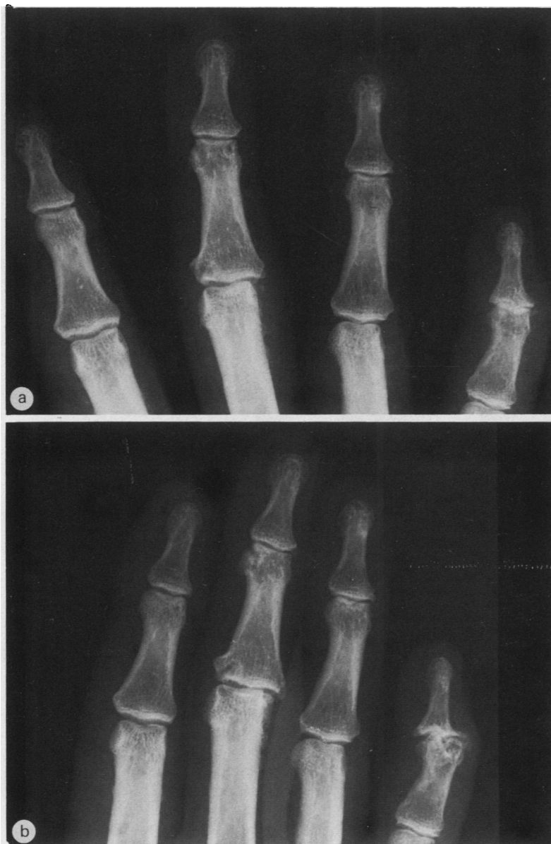
Figure 2: Radiographs of fingers of the right hand of a female transplant recipient (15 years' duration; one year haemodialysis) at age 53 (a) and 58 (b). Note progression of arthritis, resulting in severe loss of subchondral bone, osteophytosis, and deformity in the distal interphalangeal joint of the little finger, and loss of articular cartilage, subchondral sclerosis, osteophytosis, and deformity in the interphalangeal joint of the middle finger. Less severe osteoarthritis is present in other distal interphalangeal joints.

Of the 21 patients with grade III or IV OA, all had distal interphalangeal joint involvement, and in addition five and nine respectively had proximal interphalangeal joint and first carpometacarpal joint involvement. All but two of the 21 patients also had erosion of subchondral bone in at least one of the affected joints. In most patients the joints were affected in an asymmetrical fashion with articular abnormalities ranging from normal in some joints to severe destructive changes in others. Review of earlier hand radiographs showed that minor osteoarthritic changes often progressed rapidly to destructive erosive OA (figs 1-3), a phenomenon which we had observed previously in our index cases. 1 No patients had degenerative changes isolated to the proximal interphalangeal or first carpometacarpal joints. In 17 of these 21 patients Heberden's nodes were clinically apparent, and three of the five with proximal interphalangeal joint involvement had Bouchard's nodes. None of the patients gave a definite history of an inflammatory episode involving affected joints, but 14 of the 21 affected had joint pain or stiffness with mild to moderate loss of function. Several patients had marked vascular calcification, but significant periarticular soft tissue calcification was present in only one patient with OA.